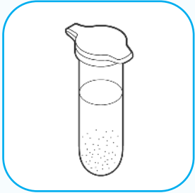
Sample Homogenization 0.2, 1.0 or 2.0 g